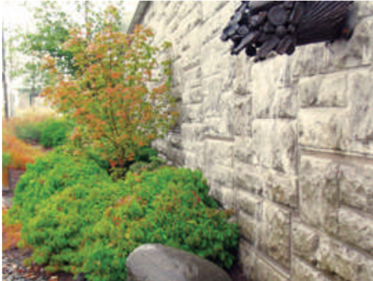
A piece from the exhibit Landscapes for Rain: The Art of Stormwater

Integrating stormwater management with the urban landscape