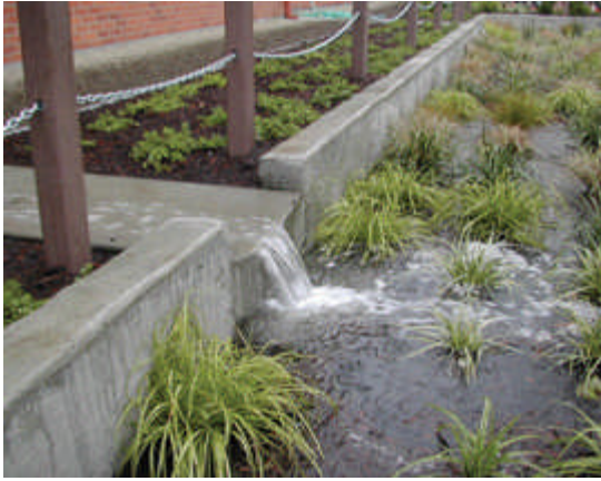
Portland Green Streets at SE 12th and Clay