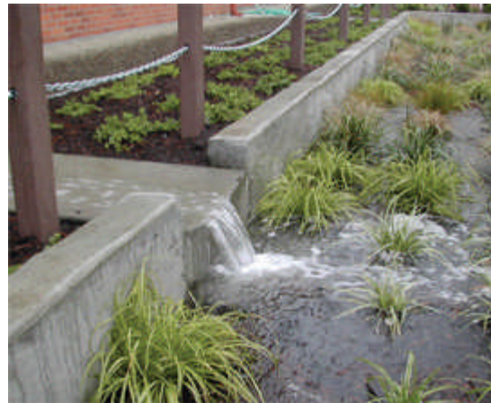
A runnel from a downspout at Mt. Tabor Middle School rain garden

The highlight of the Green Streets program is the way that onsite stormwater management is integrated with an urban setting. The comprehensive approach uses different low-impact development (LID) strategies at different sites. Some of the seven locations on the Green Streets tour are included in other tours, such as PSU with the innovative vegetated street planters and New Seasons Market with its green roof and other LID techniques.