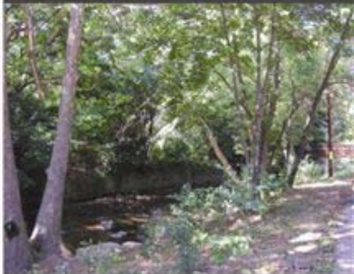
Parking lot near Central Avenue and Tookany Creek Parkway after the streambank restoration in 2003.

A Management Guide for Landowners Along Tookany Creek Watershed's Streams, Creeks, Ponds & Tributaries.