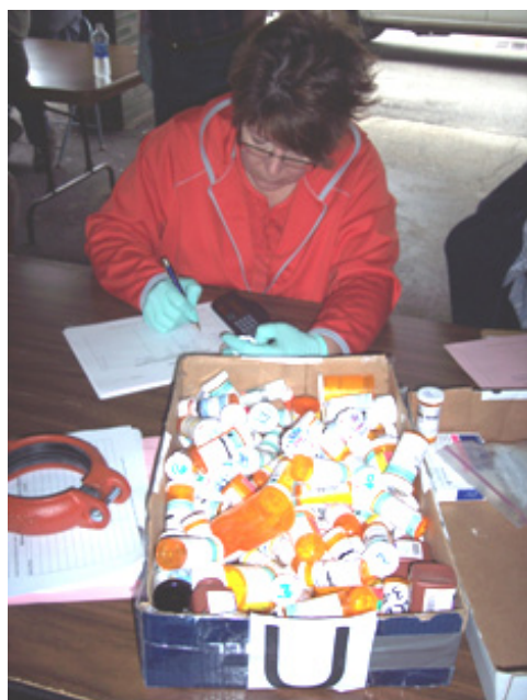
Figure 1. Unused and unwanted medicines being collected.

All of these chemicals are used by humans or given to animals and are finding their way into our water supplies. The purpose of this fact sheet is to explain the source of these chemicals, how they are getting into our water supplies, and how each person should properly dispose of unwanted or no-longer-needed PPCPs.