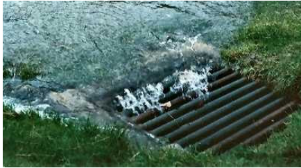
An overloaded storm sewer

Our land is being covered with non-porous surfaces: streets, driveways, parking lots, sidewalks and rooftops. During storm events, rainwater landing on these impervious surfaces can't be absorbed into the ground. Instead it runs off into our storm sewers, roads and creeks. Too much stormwater running off without a place to infiltrate can cause flooding, severe streambank erosion, and degradation of water quality.