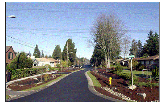
A street lined with rain gardens

Rain gardens also help to reduce non-point source pollution. Plant roots can uptake pollutants such as fertilizer or pesticide from surface runoff and prevent them from entering our water supply.