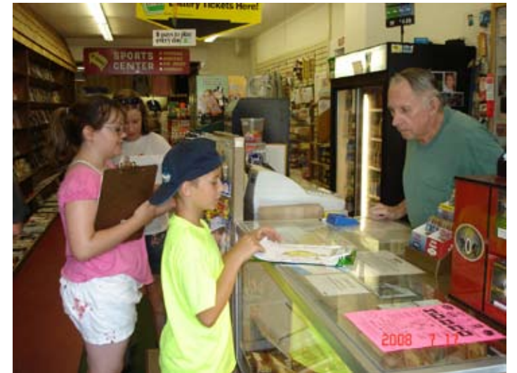
Jefferson County students educating businesses about water pollution

Don't dispose of paints, oils or cleaning products down the drain. Call the Jefferson County Solid Waste Authority to find out how to properly dispose of these chemicals. (814) 849-1521