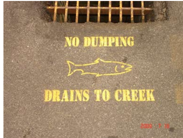
Students painted this message near Brookville Borough storm drains