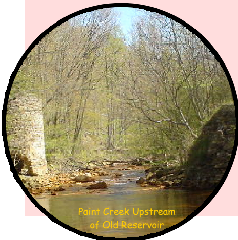
Paint Creek Upstream of Old Reservoir